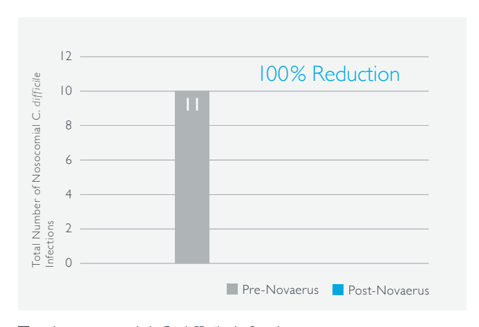
Total nosocomial C. difficile infections.